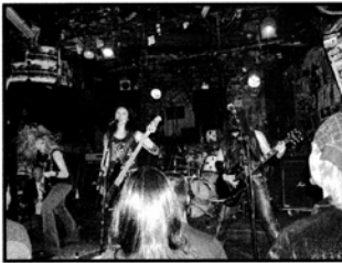
At the legendary CBGBs in New York City

continues to win the praises of publications on all levels, from the Pittsburgh Post-Gazette to national magazine, ROCKRGRL , and international publications, Metal Maidens and Metal Maniacs . Working around the country from Chicago & Detroit to NYC, they really do get around, playing New York's CBGB's on October 22 nd and opening for the legendary Misfits at the Machine Shop in Flint, Michigan. They have also shred it on countless beer-soaked stages with like-minded aggressors such as BROADZILLA , BOTTOM , HONKEY , MODEY LEMON , TWO MAN ADVANTAGE , HARLOW , LO PRO and BITCHCAT , to name a few. Here at home, the band exercises their self-described "iron clad work ethic" on the stage and in open competition. Winners of the 2004 Rolling Rock Hard & Heavy Rock Challenge (held at Nick's Fat City), they bested nineteen other contenders and earned the respect of the Pittsburgh music community in a serious way.